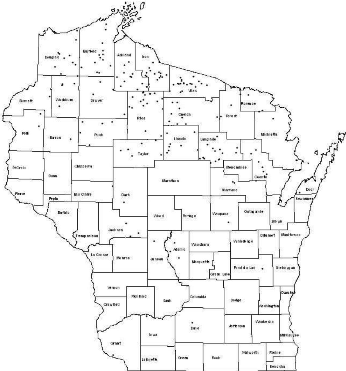
Figure 2. Reported probable and possible wolf observations, October 2001 to March 2002.